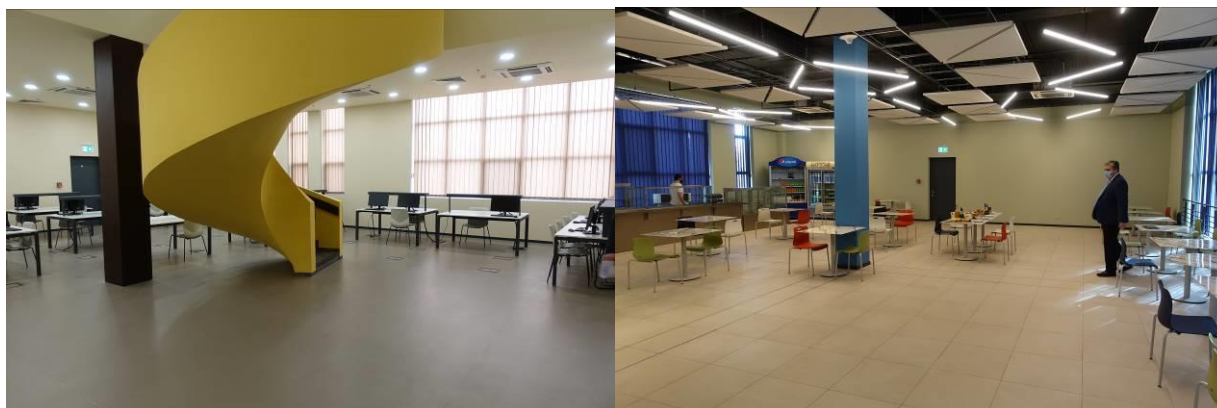
Scientific building – library, canteen