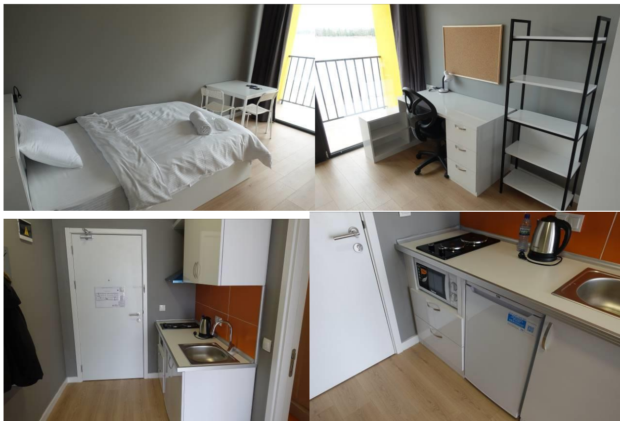
Accommodation – single room for jurors and leaders