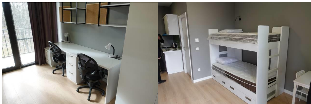
Accommodation – double room; Study rooms (below)