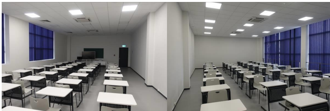
Scientific building – fights rooms