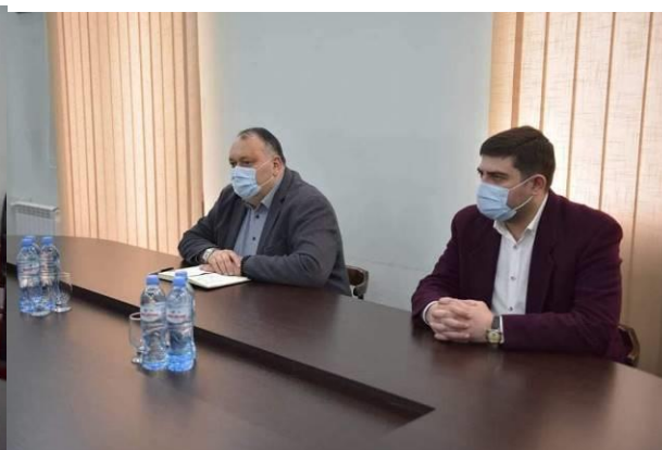
Meeting with the Mayor of Kutaisi