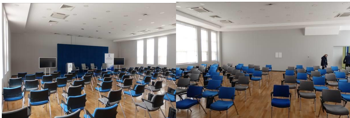
Scientific building – large room