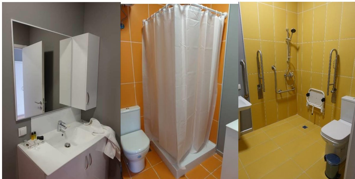
Accommodation – bathroom, bathroom in accessible room