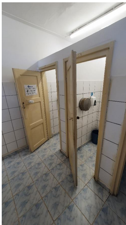
Dormitories for students