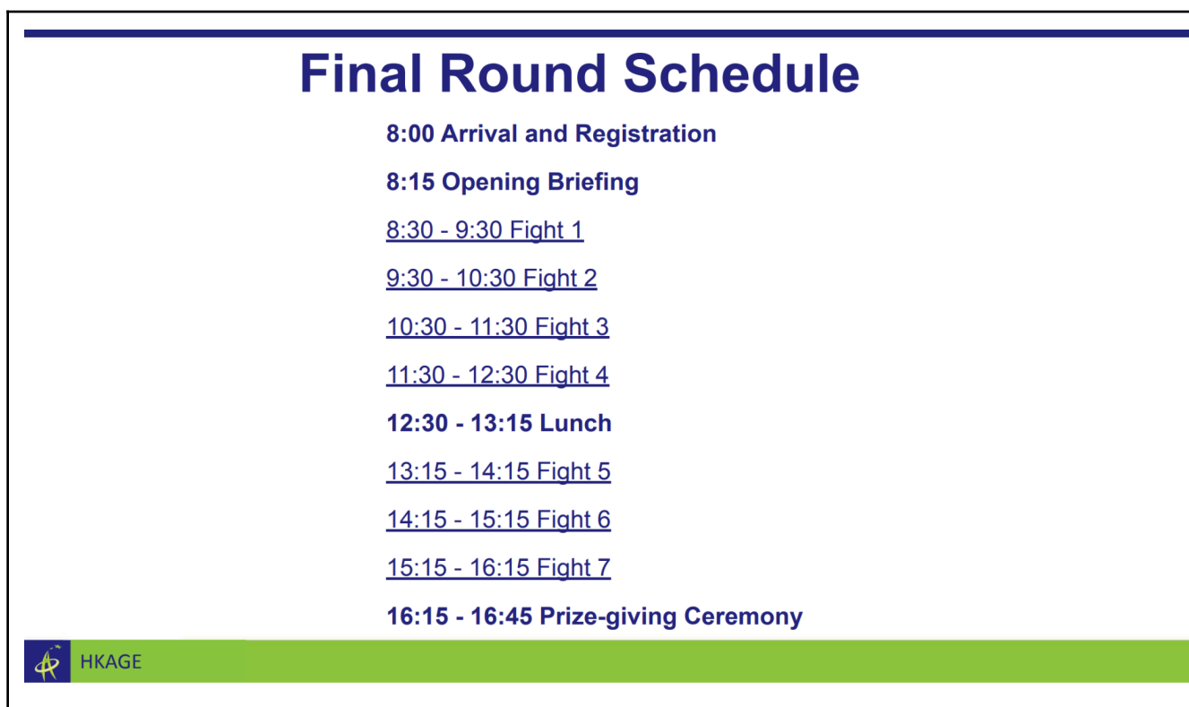
Fig.2 HKYPT 2025 Schedule

HKYPT 2025 final round took place at West Island school, ESF on 22 February 2025. Fig 2 is the event schedule. While following the same format of IYPT (except no Reviewer role), each team will compete as the reporter and opponent roles twice. All the jurors fulfilled the requirements of IYPT (most of them are physics professors from the local universities). With the IYPT scoresheet, each team's performance will be calculated and using the same weighted approach from IYPT. The team will be ranked based on the final scores. Top five teams will be eligible to send one student from their team to form our Hong Kong team. If any of the teams forfeit this opportunity, the next ranked team will be eligible (i.e. ranked 6th and onwards) to do so. This is to encourage the participation from more secondary schools in Hong Kong.